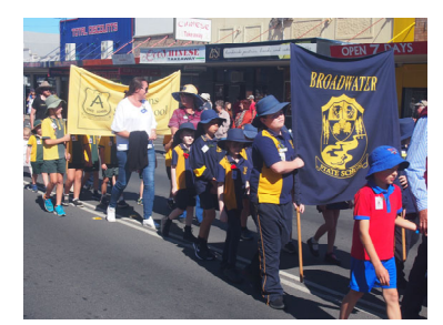
Pictured - School and Community Groups march proudly on Anzac Day.